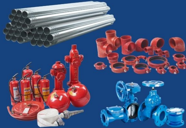
PIPES • VALVES • GROOVED FITTINGS • SPRINKLERS