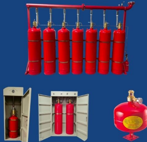
CABINET TYPE • PIPE NETWORK TYPE • HANGING TYPE